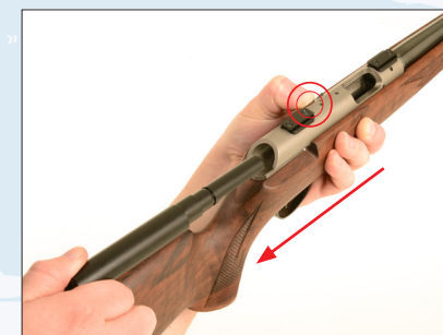
5. Pull the cleaning rod guide out of the action.