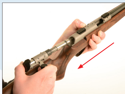
1. Remove the bolt from your firearm (may vary due to the model).