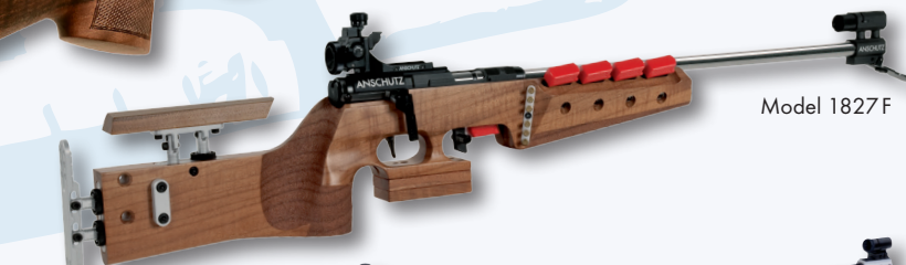
Model 1827 F