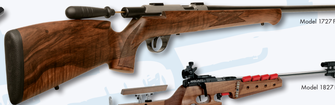
Model 1727 F