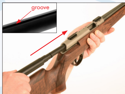
2. Insert the cleaning rod guide into the action and push up against the stopper. See that the groove is pointed in the direction of the trigger (down).