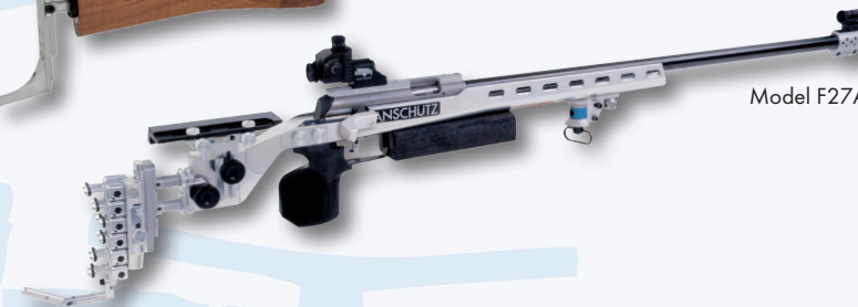
Model F27 A