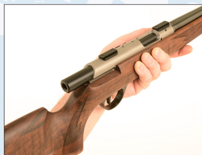
3. Now the cleaning rod guide is inserted correctly. The cleaning rod guide is suitable for all cleaning rods up to cal. .22 l.r.